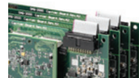
SSI bus cable for multiple cards synchronization

* Note: Analog output related pins on the DAQ/DAQe-2214