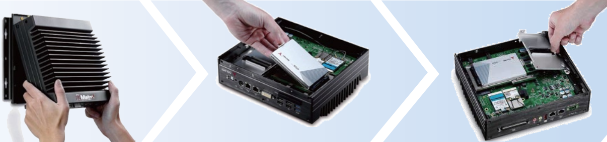
1. Ready-to-deploy wall mount kit