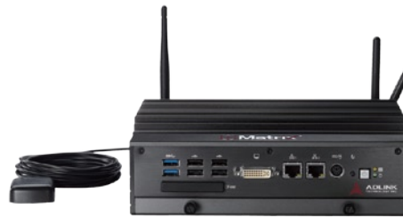
MXE-5300 with Antenna