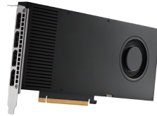
• NVIDIA RTX A4000