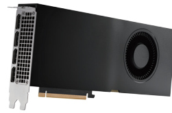
• NVIDIA RTX A5000