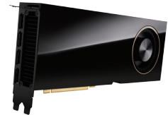
• NVIDIA RTX A6000