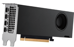
• NVIDIA RTX A2000

PCI Express Graphic Cards with NVIDIA GPUs